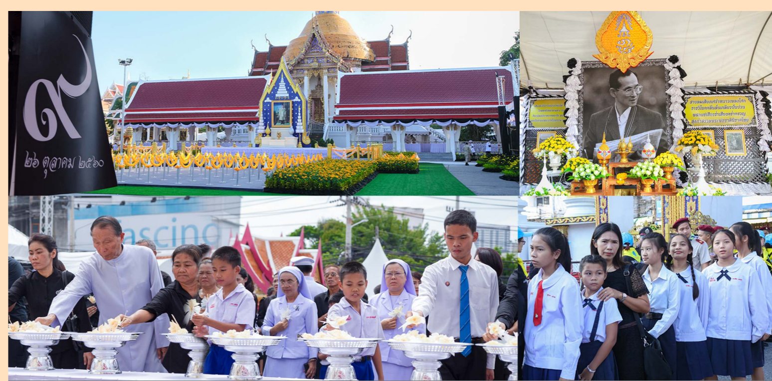
▲ Paying Homage to the Late King : The management and staff members of the Pattaya Orphanage brought representatives of children to Wat Chaimongkhon Royal Monastery in South Pattaya to offer sandalwood flowers at the replica crematorium and pay homage to His Majesty the Late King Bhumibol Adulyadej while the Royal Cremation was being held in Bangkok..